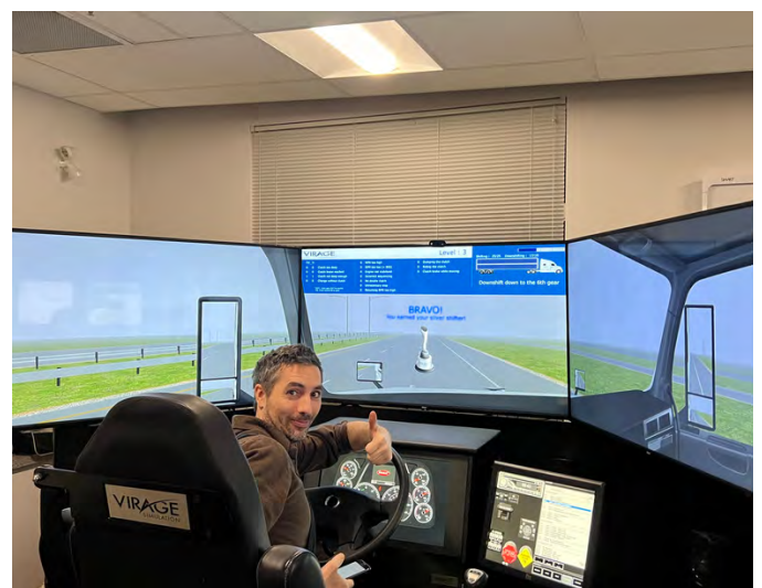
Commercial driving student & CNIM - simulator training