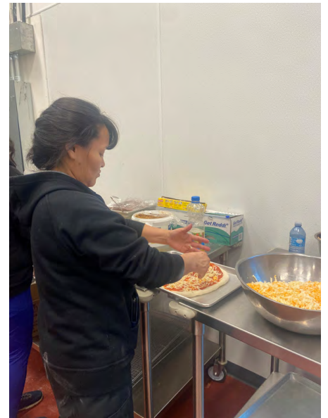
Students preparing good during the Old Crow, as part of the culinary portion of the program.