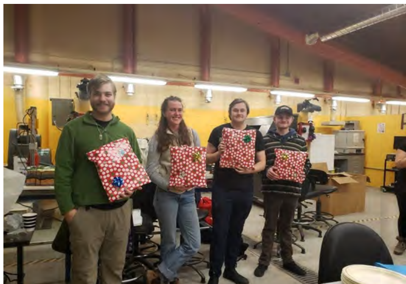
First-year Earth Sciences students proudly receiving their Earth Sciences sweatshirts in December 2023.

There are several exciting events associated with course offerings this semester which will introduce students to the broader geoscience community in the Yukon. Students in the Geochemistry course will visit ALS Laboratories in Whitehorse to learn about sample prep and processing. Hydrogeology students will work in collaboration with the Water Resources Branch, Yukon Government, to complete a semester-long water balance project at Marsh Lake. Hydrogeology students will also benefit from several guest lectures, learning about topics including geothermal potential in the Yukon, the Faro Mine Remediation Project, and the Yukon Observation Well Network.