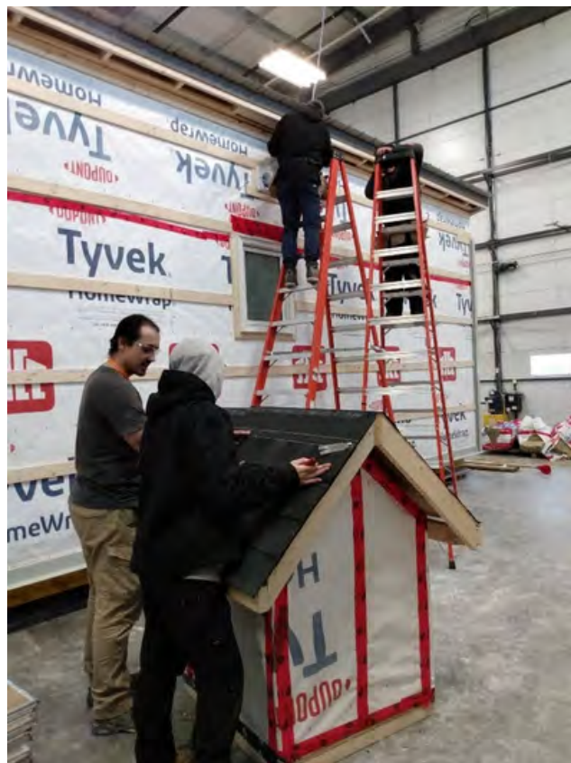
Instructor and students.