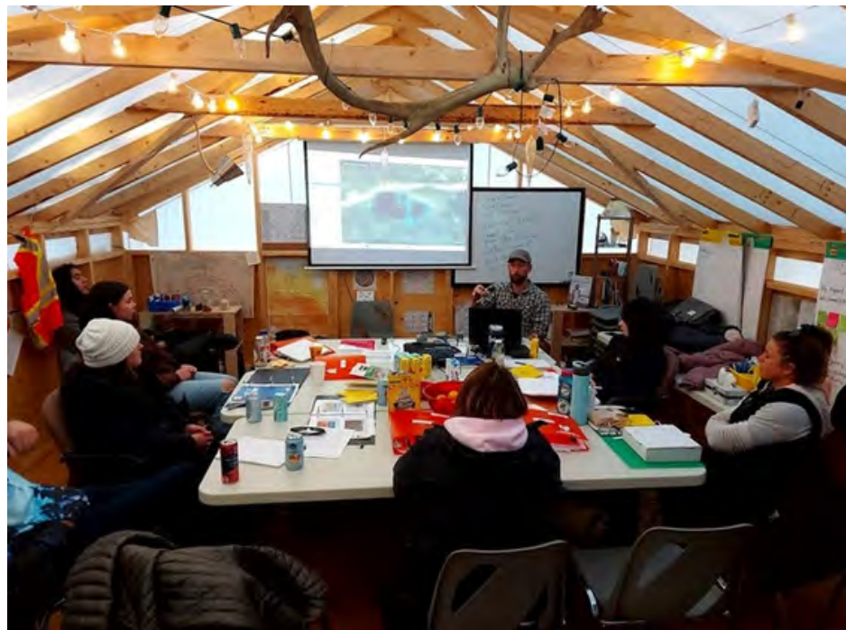
Students participate in the ENVM 090 Instruction in the Vadzaih Zeh Wall Tent classroom, December 2023.

ENVM administrators and instructors also developed and submitted a proposal to Crown-Indigenous and Northern Affairs Canada (CIRNAC) for three years of continued program funding, which included a request for support for a half-time coaching position. With Youth Employment and Skills Strategy (YESS) funding expiring at the end of March 2024, this approach would secure the coaching supports that are so critical to the success of the ENVM Program.