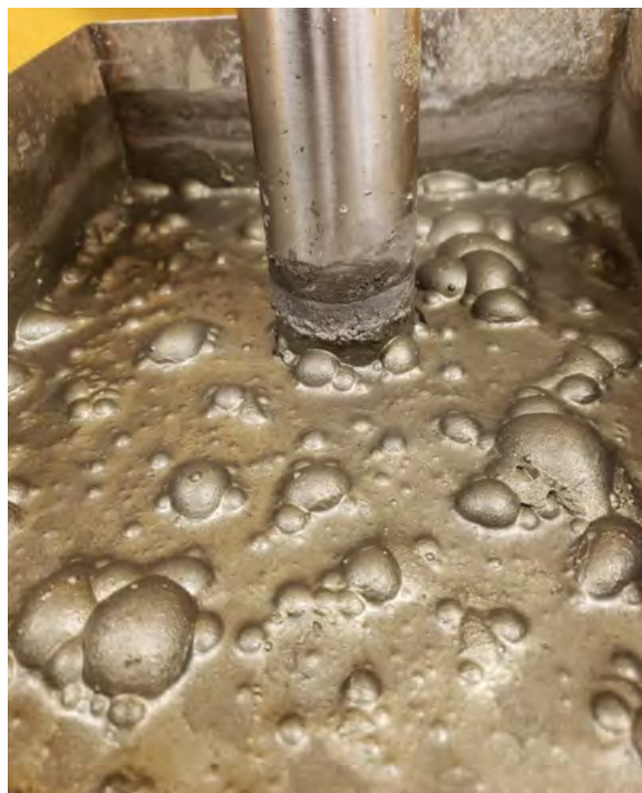
Laboratory-scale froth floatation tank separating copper sulphide minerals in the Earth Sciences Laboratory.