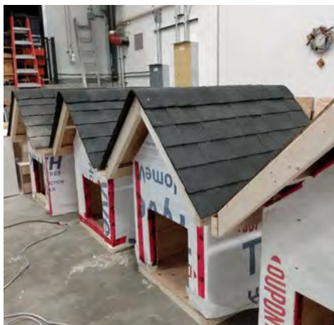
Student dog house projects.

In December, the Whitehorse-based Champagne Aishihik First Nations (CAFN) Housing Maintainer project continued to progress through several stages of construction. Utility rough-ins were completed and inspected, interior insulation was completed, and drywall was installed and finished. Students also completed shingle roofing on their doghouse shop projects. Housing Maintainer students look forward to completing house construction in the new year by March 2024.