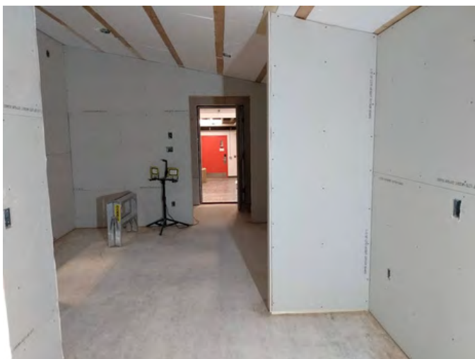
Interior house progress.