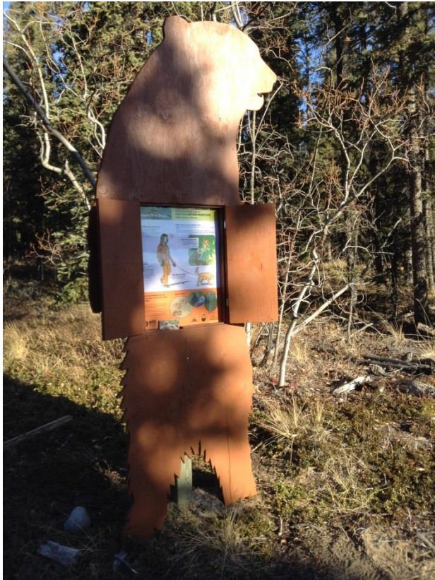
Figure 2. The oversized silhouette of a grizzly bear (approx. 215 cm high) was cut out of 1.9 mm thick plywood and mounted on a 2m 4x4 post set in the ground. The doors on the front of the bear open to reveal the bear safe messages; a display rack for brochures is mounted under the sign.

Our hope was to sample the same composition of staff and students as Ashthorn (2016) but we were told that we should not send the questionnaire to Yukon College staff because of the danger of contributing to “survey fatigue”. To solicit feedback from students we made arrangements with Student Services to put up a static display of the bear sign poster outside the Yukon College Bookstore, in the Pit area, with a sign encouraging students to fill out an anonymous printed copy of the questionnaire (Appendix 1) or use their smartphone to link to the actual SurveyMonkey form online using a QR code. We did not receive any completed questionnaires using this approach. We asked several instructors to invite the students in their class to complete the survey. This approach was more successful and we received a total of 27 responses.