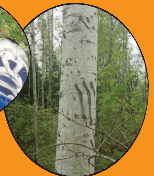
Markings on trees